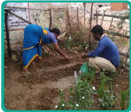
T. Mettupatti ICDS Centre, Tirunelveli Melapathi School, Cuddalore

The Maternal Child Health Training program was conducted every month for ANC Mothers, ICDS Teachers, College Students, School Children, Nehru Yuva Kendra and general public. The topics covered were: Govt. Schemes - 108, 104; CM Insurance Schemes; Food & Nutrition and Kitchen Garden.